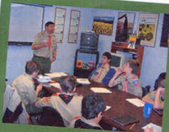
Junior Leader Training

Patrol: Pyros Rank: Life Age: 14 Favorite Sport: Hockey Favorite Movie: Anger Management Favorite Book: Peterson's 4-Wheel & Offroad Magazine Favorite Saying: "Freedom Isn't Free"