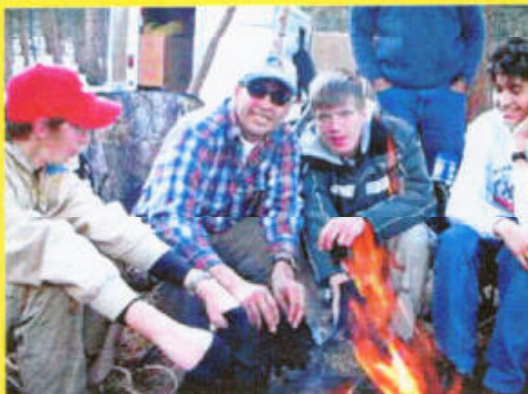
Fall Fun Campout