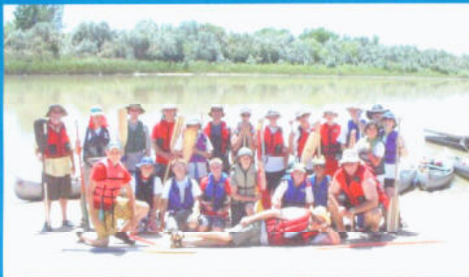
Green River Canoe Trip

As we get set to wind up the summer and start another school year, we look back and see that this was the most active in the troop's history. This summer, we attended scout camp at Camp Laramie Peak, had a high adventure trip down the Green River, and had 10 scouts attend another high adventure trip on Lake Powell. We had weekend campouts, service weekends at Ben Delatour Scout Ranch, service projects, a Saturday trip to the Renaissance Festival, and a backpacking trip. We had scouts participate in Mountain Man and the Fifty-Miler at summer camp. We also had our annual Patrol Leader's Council program campout at Chimney Park. All this in the span of about two and one-half months!