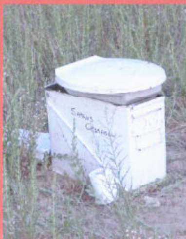
Luxurious Facilities on Green River