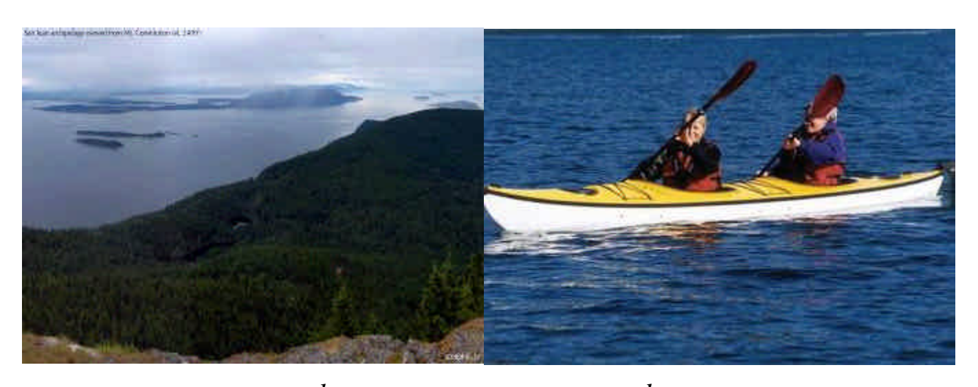
July 15<sup>th</sup> through July 22<sup>nd</sup>, 2007